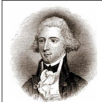
Portrait of Ebenezer Denny, Courtesy Wikimedia]

chiefly recruits, are tolerably well-disciplined, but the remainder...being levies, and raised but for six months and their times expiring daily, they take great liberties." 14 To defeat a determined enemy who was