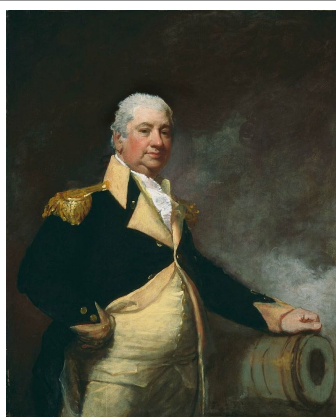
Portrait of Henry Knox

With American expansion into Ohio and the entire Northwest Territory now at risk, on March 4, 1791, the president named Arthur St. Clair, Governor of the Northwest Territory, as the new commanding general. At first glance, one could hardly argue the choice. St. Clair had extensive combat command experience during the American Revolution as a general officer, including service as Washington's aide-de-camp. As governor of the Northwest Territory he had greater familiarity with the challenges of the new nation's frontier than most, though not experienced in Indian style warfare. He also fully understood the mission's criticality: losing Ohio to the "savages" (St Clair's term) was simply unthinkable as it would block American westward expansion and further encourage British expansionism. A concern, however, should have been his physical fitness for field command. St. Clair was a man in his mid-fifties who suffered from gout so painful as to be at times debilitating. Washington knew of this condition for St Clair had used it in a personal letter as reason for a tardy reply eight years earlier in the aftermath of the Newburgh Conspiracy. 9